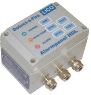
LICO Alarmpanel to control Alarmline Digital LHD cables