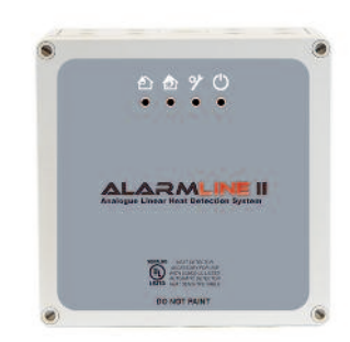
Analogue LHD Control Unit: Self Programmable

LICO Electronics GmbH Klederinger Str. 31, A-2320 Kledering, Austria Tel: +43 1 706 43 000 Email: office @lico.at _