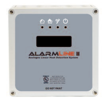
Analogue LHD Control Unit: Self Programmable